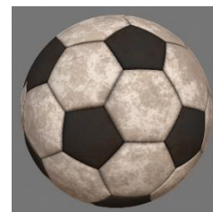
Hexagon (6-sided shape)